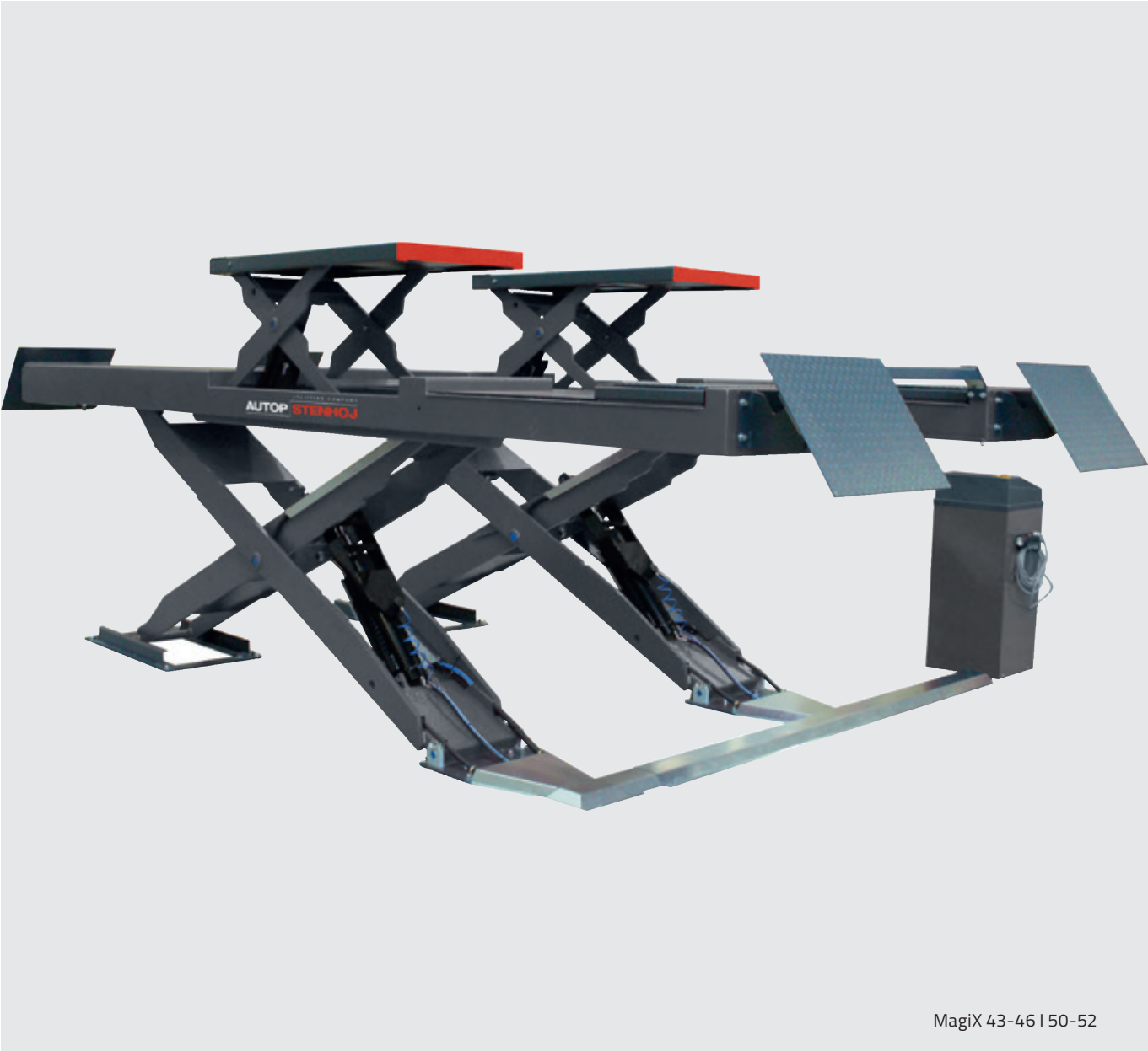
MagiX 43-46 | 50-52