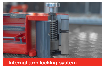
Internal arm locking system