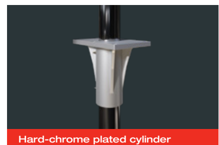
Hard-chrome plated cylinder