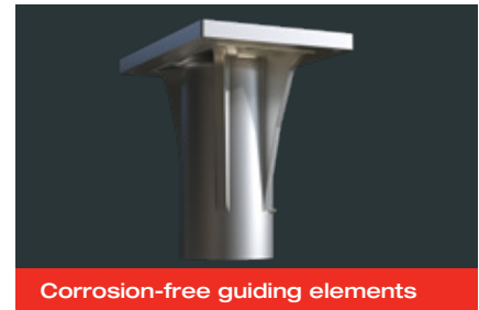
Corrosion-free guiding elements