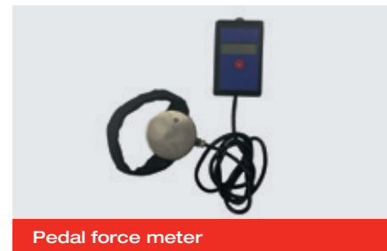
Pedal force meter