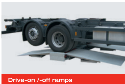
Drive-on /-off ramps