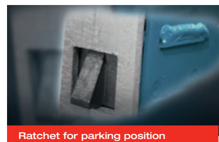
Ratchet for parking position