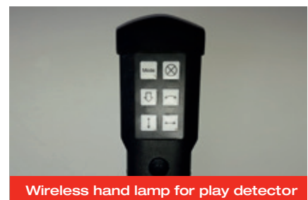
Wireless hand lamp for play detector