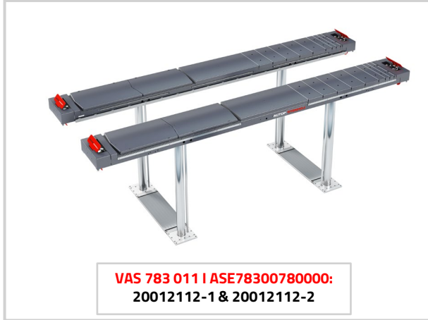
VAS 783 011 | ASE78300780000: 20012112-1 & 20012112-2

Elektro-hydraulic 4-ram lift, 5.5 t, with platforms