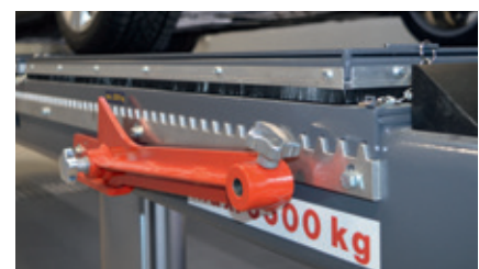
Slip plate and MKS adaptor