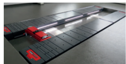
Installation in rectangular recess