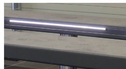
LED lighting set