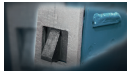
Ratchet for parking position