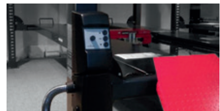
Control unit and power pack on rear left post