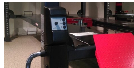
Control unit and power pack on rear left post