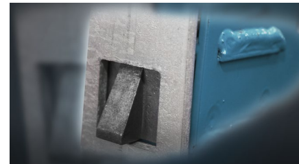
Ratchet for parking position

D = double pump unit for quicker lifting time. Control unit on front left post