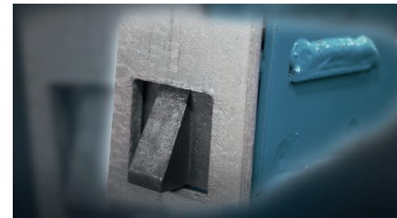
Ratchet for parking position

D = double pump unit for quicker lifting time. Control unit on front left post