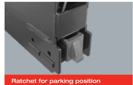
Ratchet for parking position