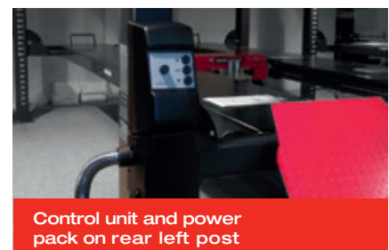
Control unit and power pack on rear left post