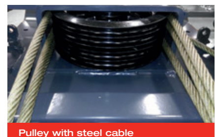
Pulley with steel cable