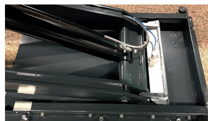
Adjustable base frame