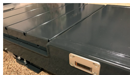
Infra-red sensor and fillers