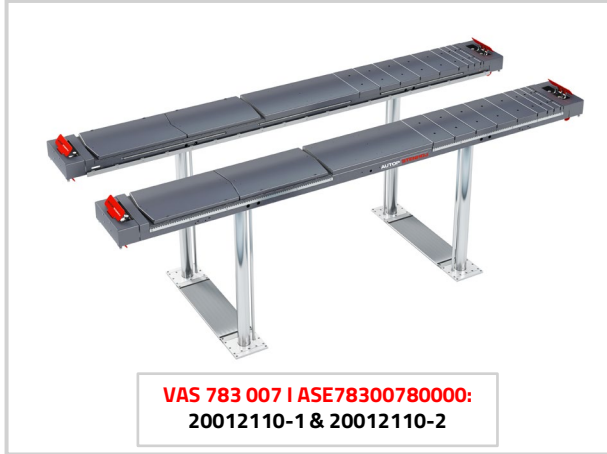
VAS 783 007 | ASE78300780000: 20012110-1 & 20012110-2

Electro-hydraulic 4-ram lift, 6.5 t with platforms